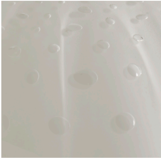
HAND BLOWN BULLICANTE GLASS

EVERY GLASS PIECE IS METICULOUSLY HANDMADE, UTILIZING TIME-HONORED METHODS. DUE TO THIS ARTISANAL APPROACH, MINOR DISTINCTIONS CAN BE ANTICIPATED, ADDING TO THE UNIQUENESS OF EACH PIECE, ENSURING IT IS TRULY ONE OF A KIND.