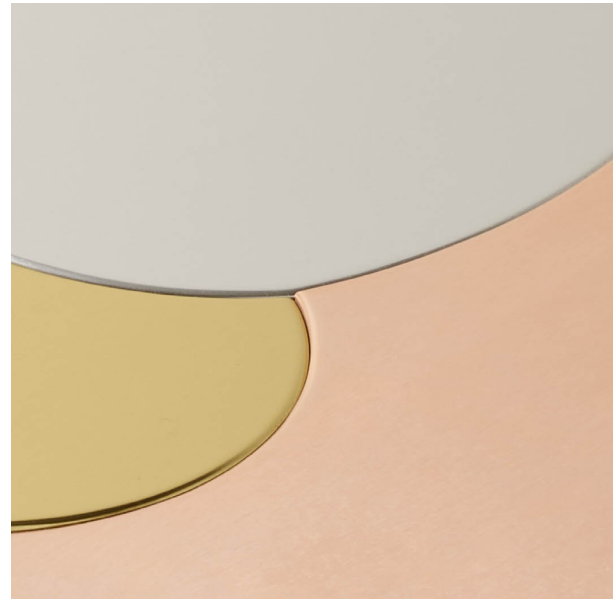
POLISHED ANODISED ALUMINIUM

WALNUT, A SOLID WOOD MATERIAL, NATURALLY REACTS TO FLUCTUATIONS IN TEMPERATURE AND HUMIDITY, CAUSING IT TO EXPAND AND CONTRACT. AS A RESULT, IT IS NORMAL TO ENCOUNTER VARIATIONS IN GRAIN PATTERNS, COLORS, AND TEXTURES, AS THESE CHARACTERISTICS ARE INTRINSIC TO THE WOOD.