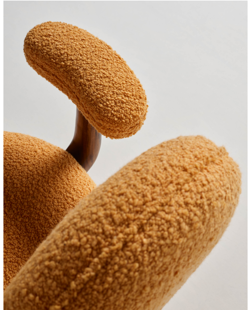
MACAROON CARVER UPHOLSTERED DINING CHAIR WITH AMERICAN WALNUT LEGS