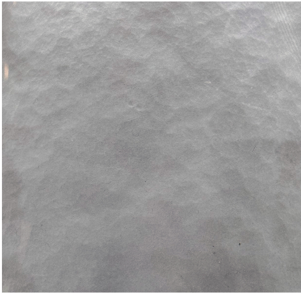
CAST SLUMPED GLASS

EVERY GLASS PIECE IS METICULOUSLY HANDMADE, UTILIZING TIME-HONORED METHODS. DUE TO THIS ARTISANAL APPROACH, MINOR DISTINCTIONS CAN BE ANTICIPATED, ADDING TO THE UNIQUENESS OF EACH PIECE, ENSURING IT IS TRULY ONE OF A KIND.