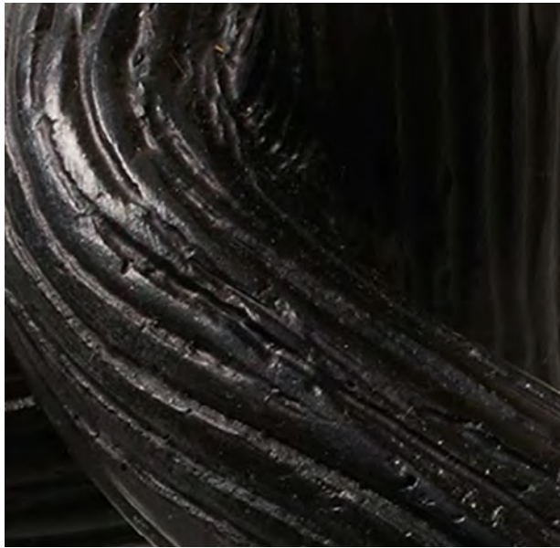
BLACKENED CAST BRONZE